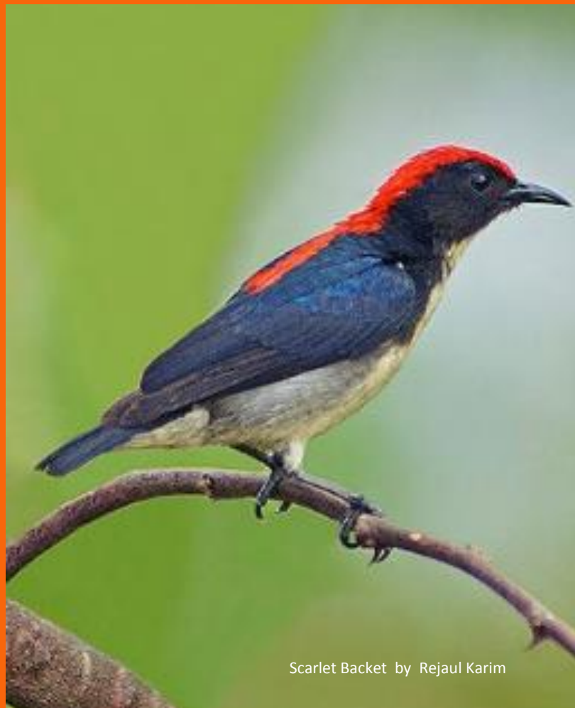
Scarlet Backet by Rejaul Karim