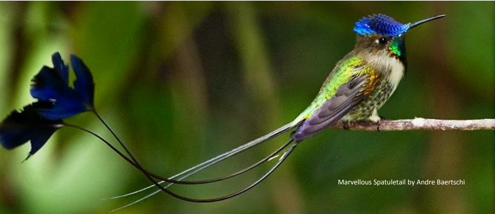
Marvellous Spatuletail