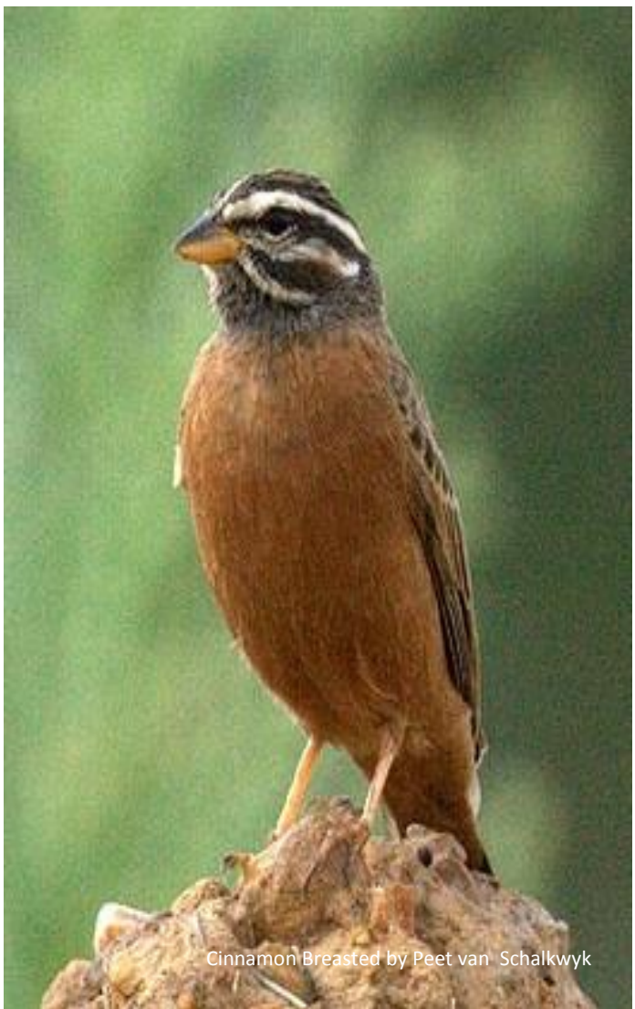
Cinnamon Breasted by Peet van Schalkwyk