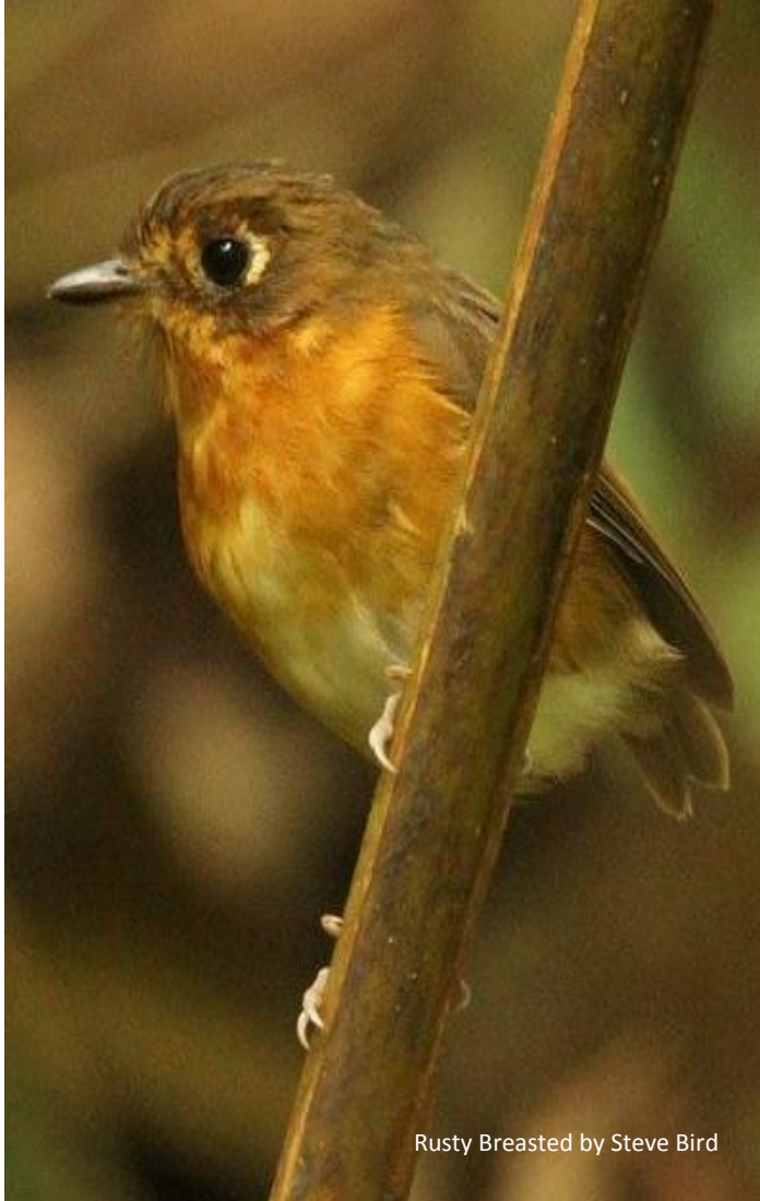
Rusty Breasted