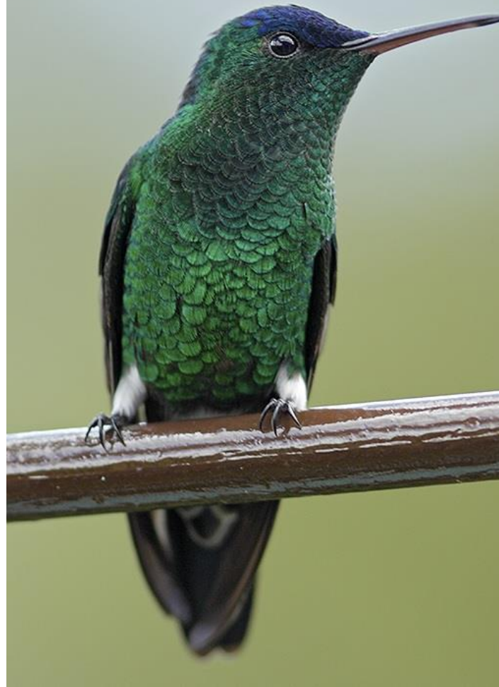
Rufous-crested Coquette by Yayo López