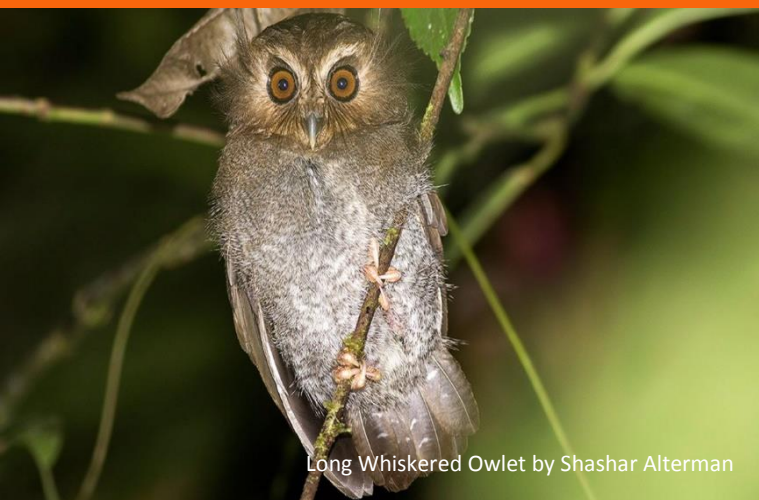
Long Whiskered Owlet