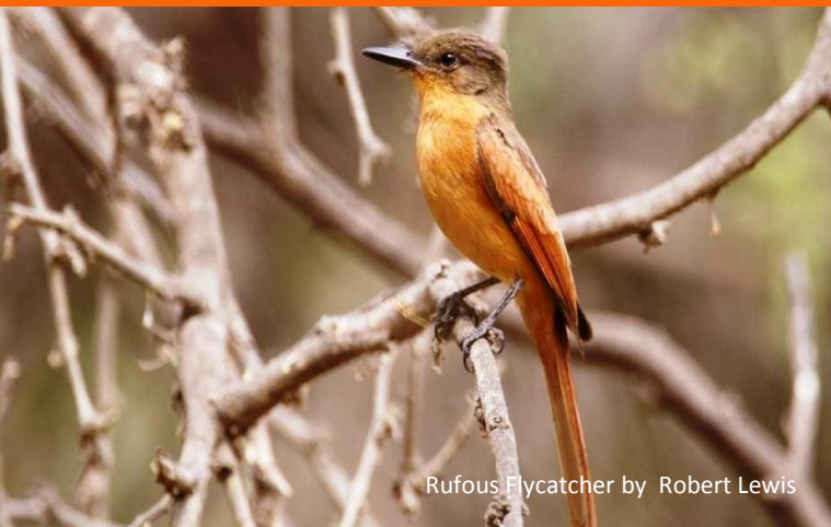
Rufous Flycatcher